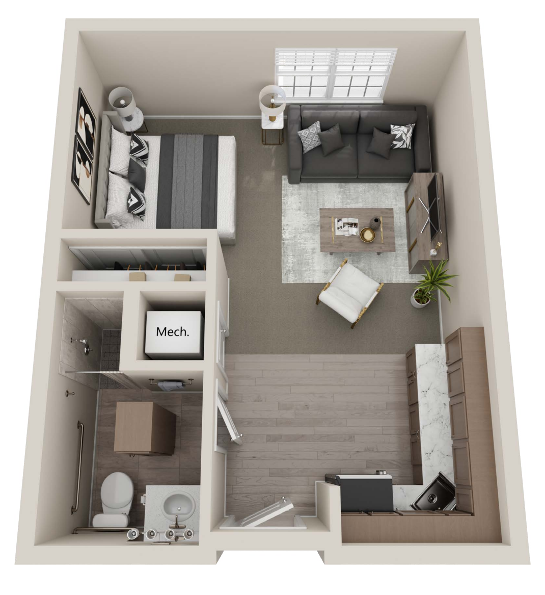
Studio | 1 Bathroom | 454 Square Feet