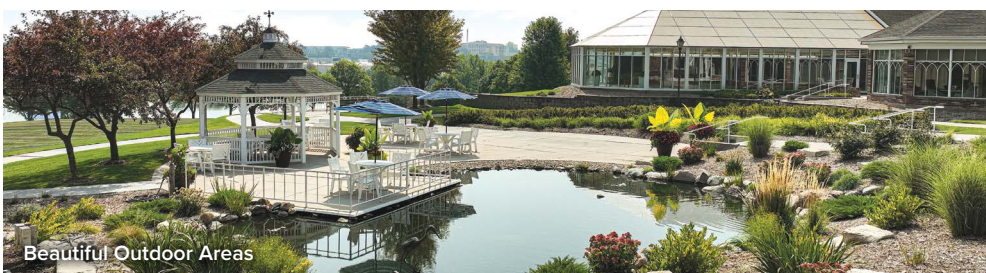
Beautiful Outdoor Areas