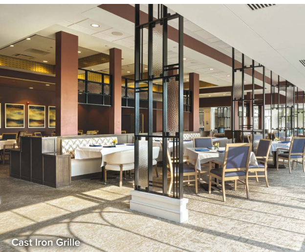
Cast Iron Grille