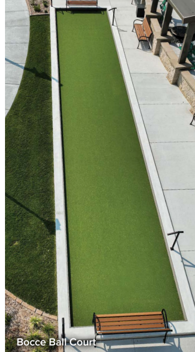
Bocce Ball Court