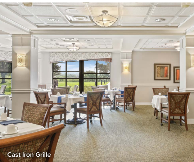
Cast Iron Grille