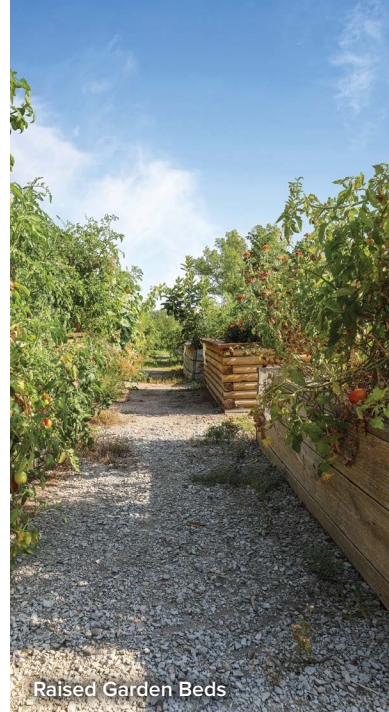
Raised Garden Beds