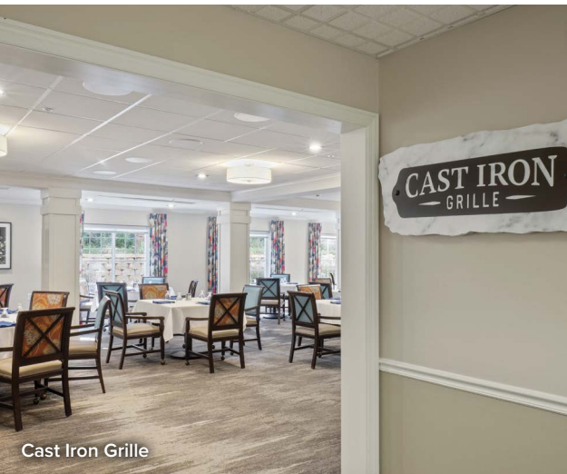
Cast Iron Grille