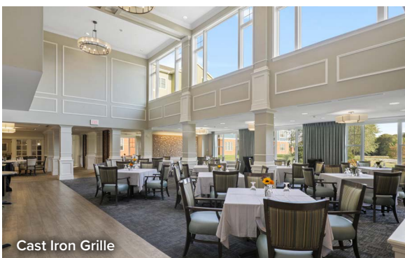
Cast Iron Grille