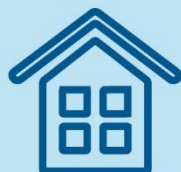
In Home Care